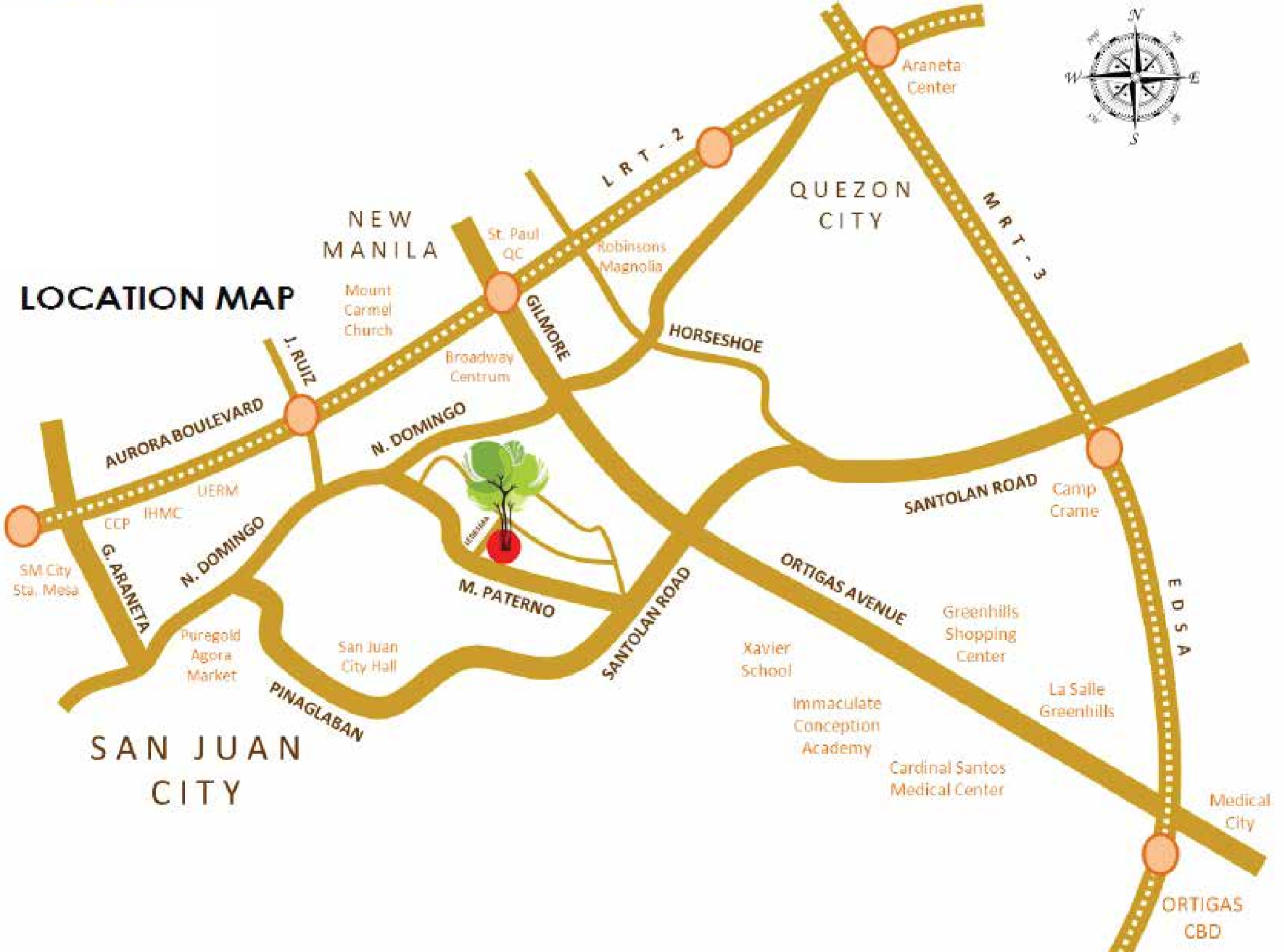
Location: Along Paterno Street corner Ledesma Street, San Juan City